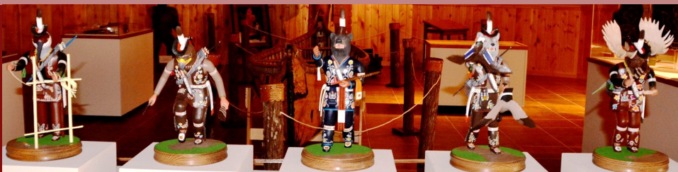
Menominee Clans Exhibit—Menominee Cultural Museum