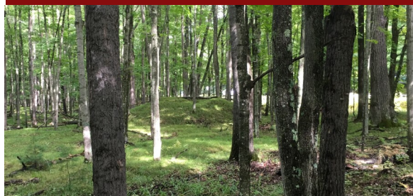
Menominee burial mound within the Backlund Mound Group and Village site