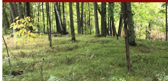
Raised Garden Beds on an upper terrace at the 60 Island Area of the Menominee River

"Over 3 miles of unique raised garden beds span the banks of the river near the 60 Island area. The existence of 1,000 year old plus agricultural garden beds at this latitude is indicative of the sophistication and traditional knowledge of the Menominee."