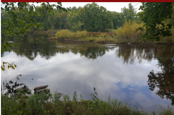
60 Island Area of the Menominee River